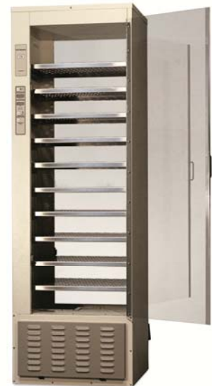
Model 136 with Maximum Full-Width Shelving Option