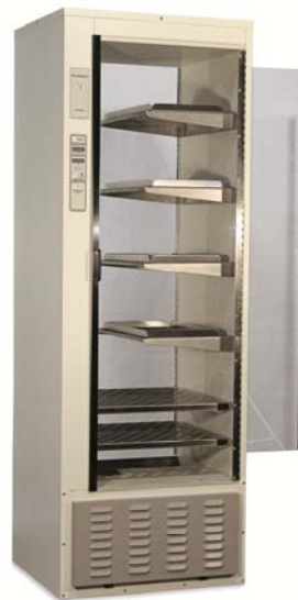
Model 136 with Half-Width & Full-Width Shelving and Small Parts Trays Options