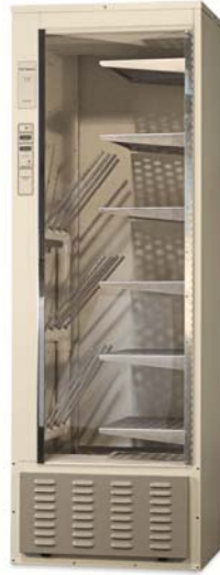
Model 135 with Half-Width Shelving and Bag & Bottle Rack Options