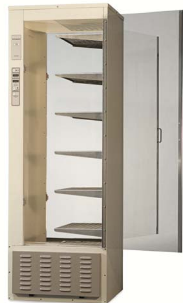
Model 136 Configuration with Half-Width Shelving Option