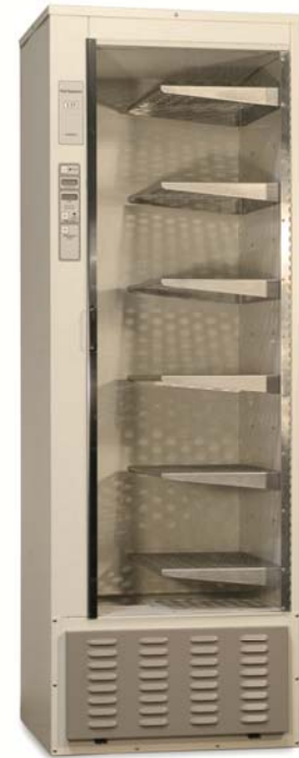
Model 135 Configuration with Half-Width Shelving Option

Two year warranty covers 100% of parts and labor, with an optional 5-year Extended Warranty Plan (parts only) available. Toll-free technical assistance for the lifetime of the equipment. Warranty service is provided through Medical Equipment Repair Association (MERA) or through in-house biomedical staff.