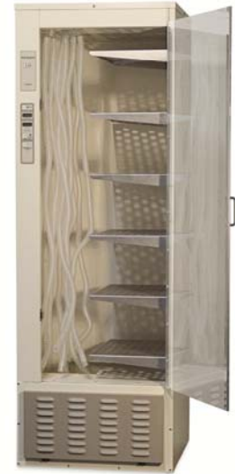
Model 135 with Half-Width Shelving and Tube Drying Rack Options