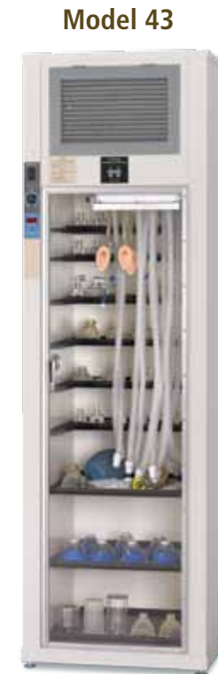
Model 43 Fast drying of tubes and parts.