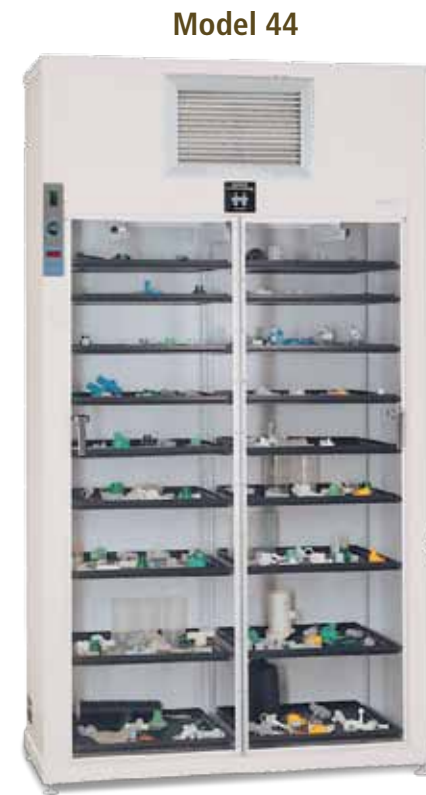
Model 44 Large drying capacity can handle full load from an Olympic Pasteumatic. Model 44 shown with extra trays.