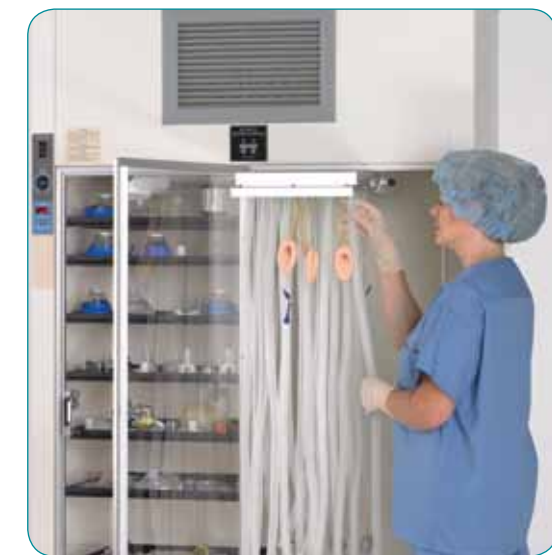
Slide-out tube holder

Easy-loading tube-holders slide out at convenient height. Holds 35 tubes up to 5 ft. (1.5 m) long. Tube-holders can be replaced with more parts trays or Bag Drier.