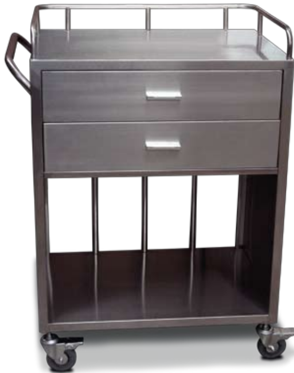
Optional stainless steel cart.