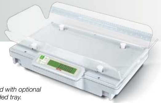
Pictured with optional four-sided tray.