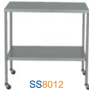
SS8012 Instrument / Back Table 18x33