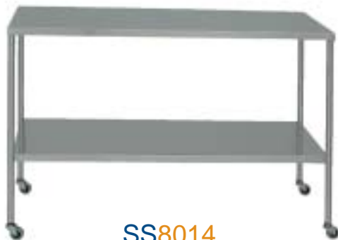
SS8014 Instrument / Back Table 20x48