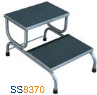
SS8370 Foot Stool ~ 2 steps

Overall Dimensions: 18" W x 15.625" H x 25" D