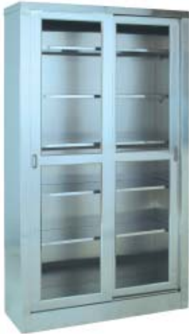
SS7816 Storage and Supply Cabinet