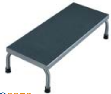
SS8372 Foot Stool ~ 1 step

Overall Dimensions: 30" W x 7.75" H x 12" D