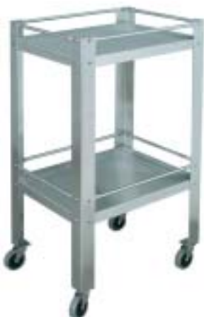
SS8096 Utility Table - Knock Down