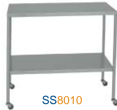
SS8010 Instrument / Back Table 20x36

Options: -480 rubber tips (32" H); .375 diameter guard rail (contact UMF for pricing)