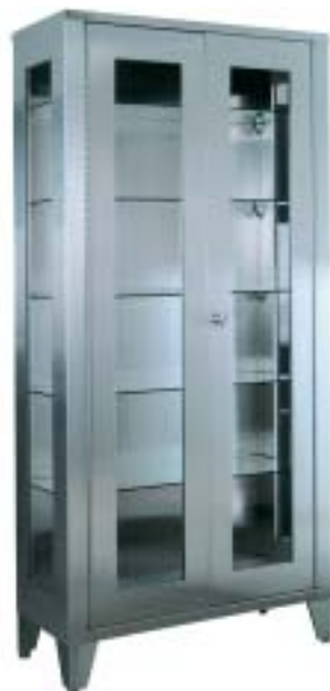
SS7840 Storage and Supply Cabinet