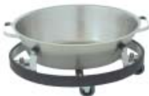
SS8355 Sponge Receptacle

10 quart basin mounted on stainless steel frame with four 2" ball-bearing swivel casters