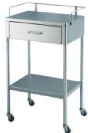
SS8153 Utility Table -1 Drawer