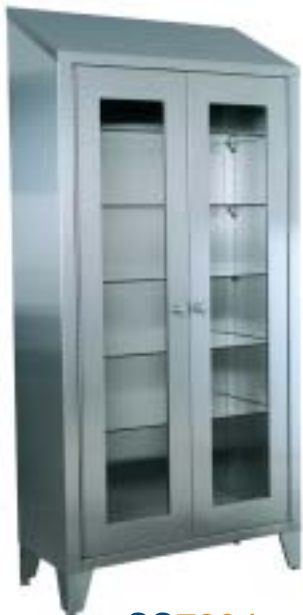
SS7834 Instrument Cabinet

All stainless steel storage and supply cabinets are available with solid doors. Please call UMF Customer Service for details.