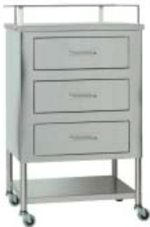
SS8151 Utility Table - 3 Drawers