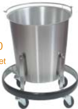
SS8350 Kick Bucket

All-welded construction, non-tip, solid balance, heavy duty rubber bumper, rubber cushions inside frame prevents pail from rattling.