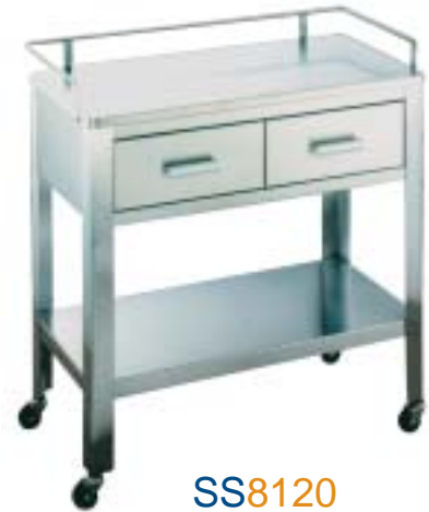
SS8120 Utility Table

Overall Dimensions: 32" W x 32" H x 16" D