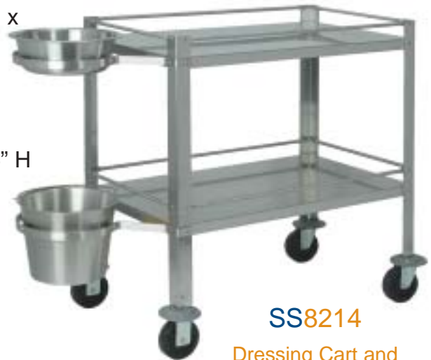
SS8214 Dressing Cart and Utility Table