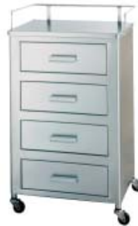
SS8150 Utility Table - 4 Drawers

Overall Dimensions: 20" W x 35.25" H x 16" D