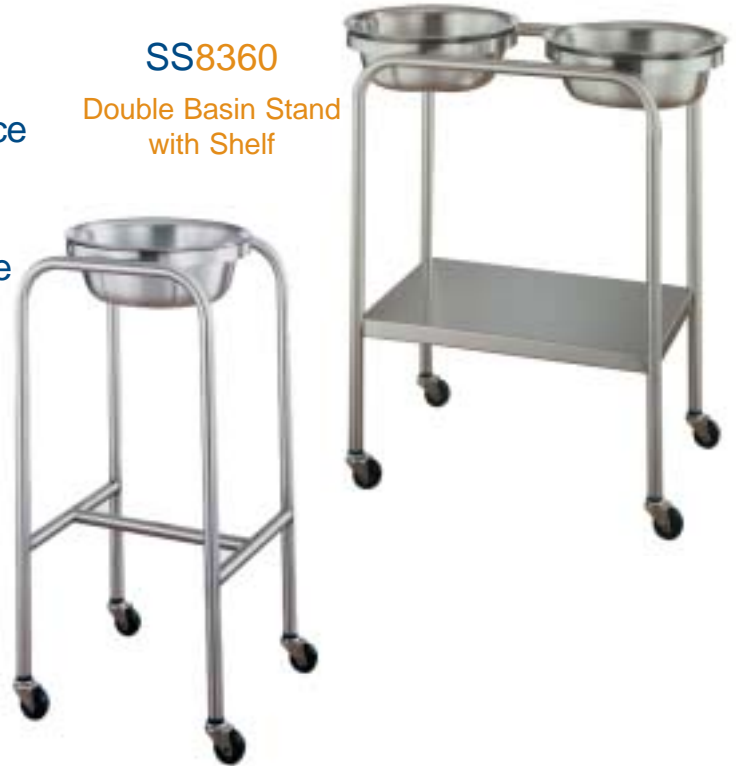
SS8360 Double Basin Stand with Shelf