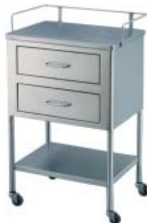
SS8152 Utility Table - 2 Drawers