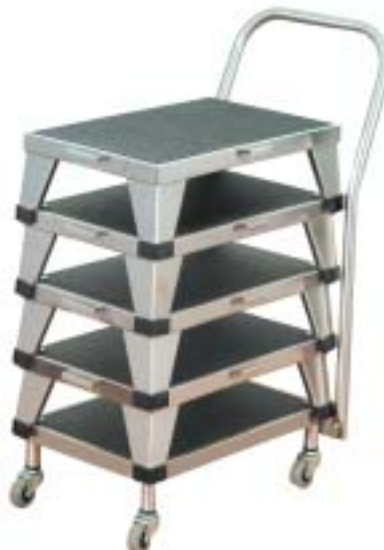
SS8380 Stackable Foot Stool

Overall Dimensions: 20.5" W x 8.5" H x 15" D Handrail 36"