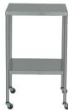
SS8018 Instrument / Back Table 16x20