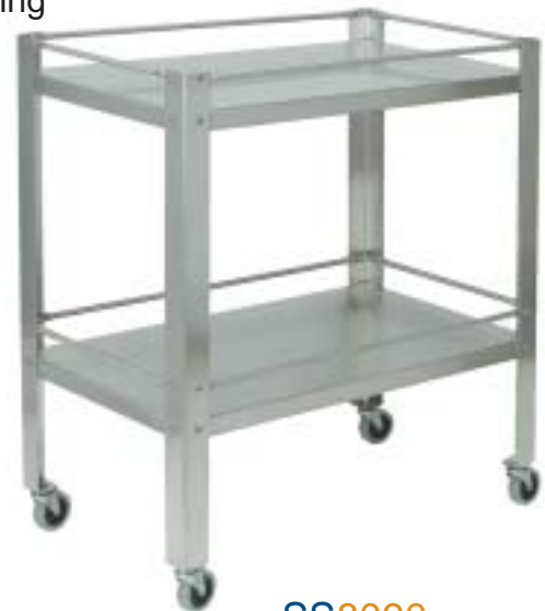
SS8090 Utility Table - Knock Down

Overall Dimensions: 20" W x 34" H x 16" D