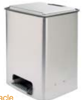
SS6849 Waste Receptacle

Overall Dimensions: 13" W x 18" H x 12" D